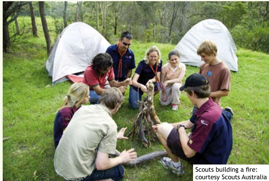
Scouts building a fire

The Scouting Program delivered by Scouts Australia, prepares young