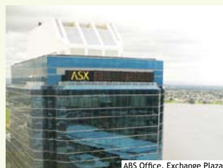
ABS Office, Exchange Plaza