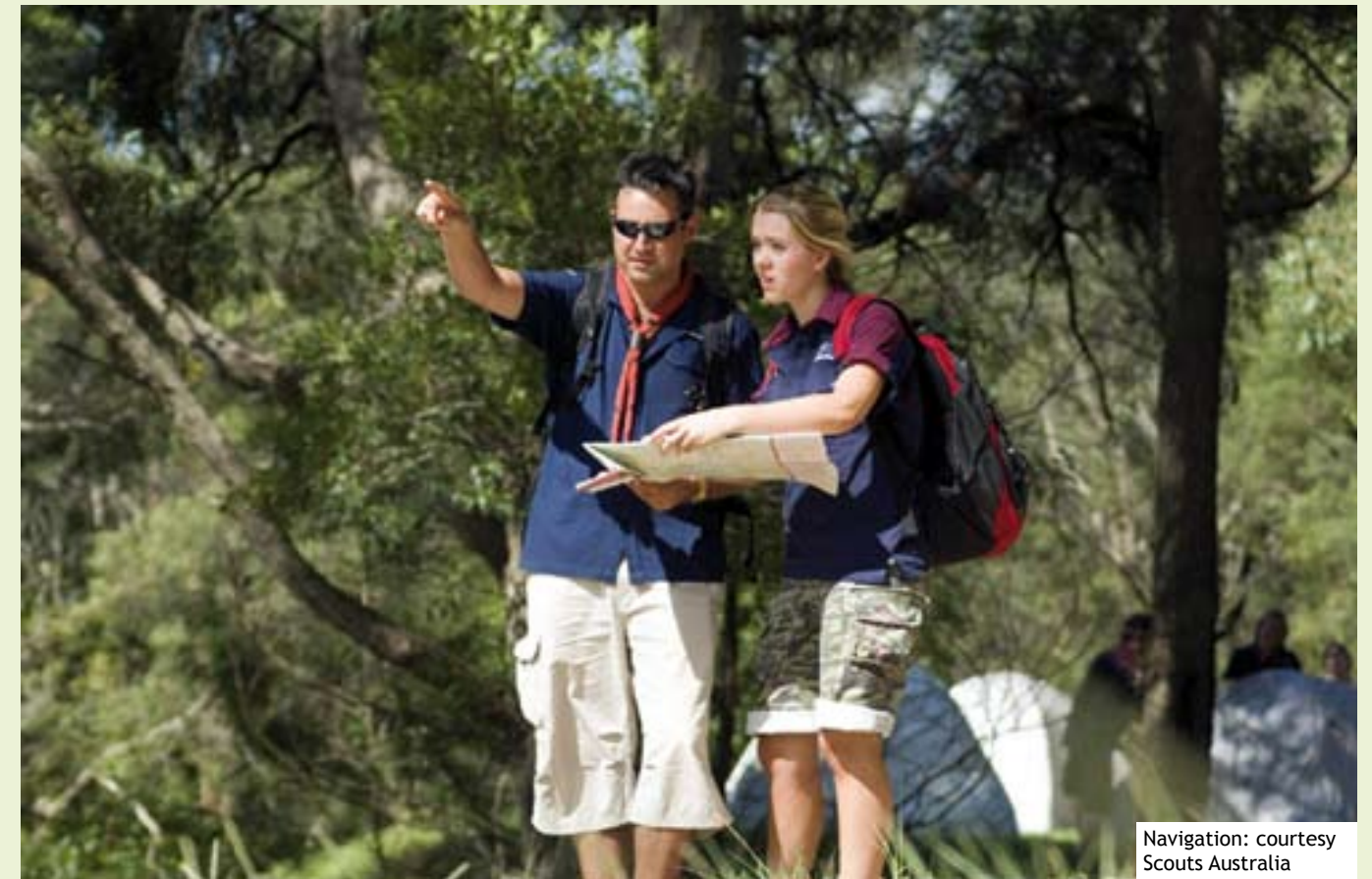
Navigation: courtesy Scouts Australia

In 2001, the life expectancy of Indigenous people was estimated to be around 17 years lower than that for the total Australian population. Rates of disability and chronic disease also reflect the well-being of Indigenous people. Indigenous adults living in non-remote areas in